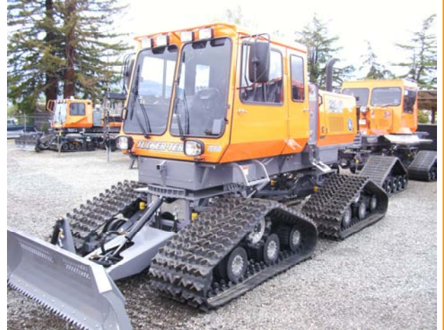
2013 2000E 2-Passenger Extended Cab