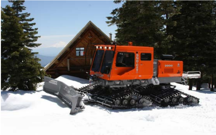
2011 2000D 5-Passenger, 12-Way Blade

If you are interested in purchasing a demonstrator please contact our sales department. We manufacture demo units for both testing and demonstrations. We also have demo transport trailers available for purchase. Purchasing a demonstrator can be beneficial. We sell our demonstrators at a discounted price yet still offer a factory warranty. Currently we have the following demo's available for immediate delivery: