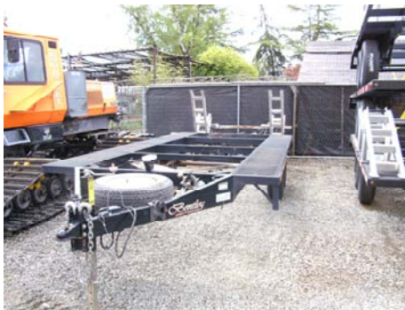
10,000lb. GVWR 2000XL Trailer